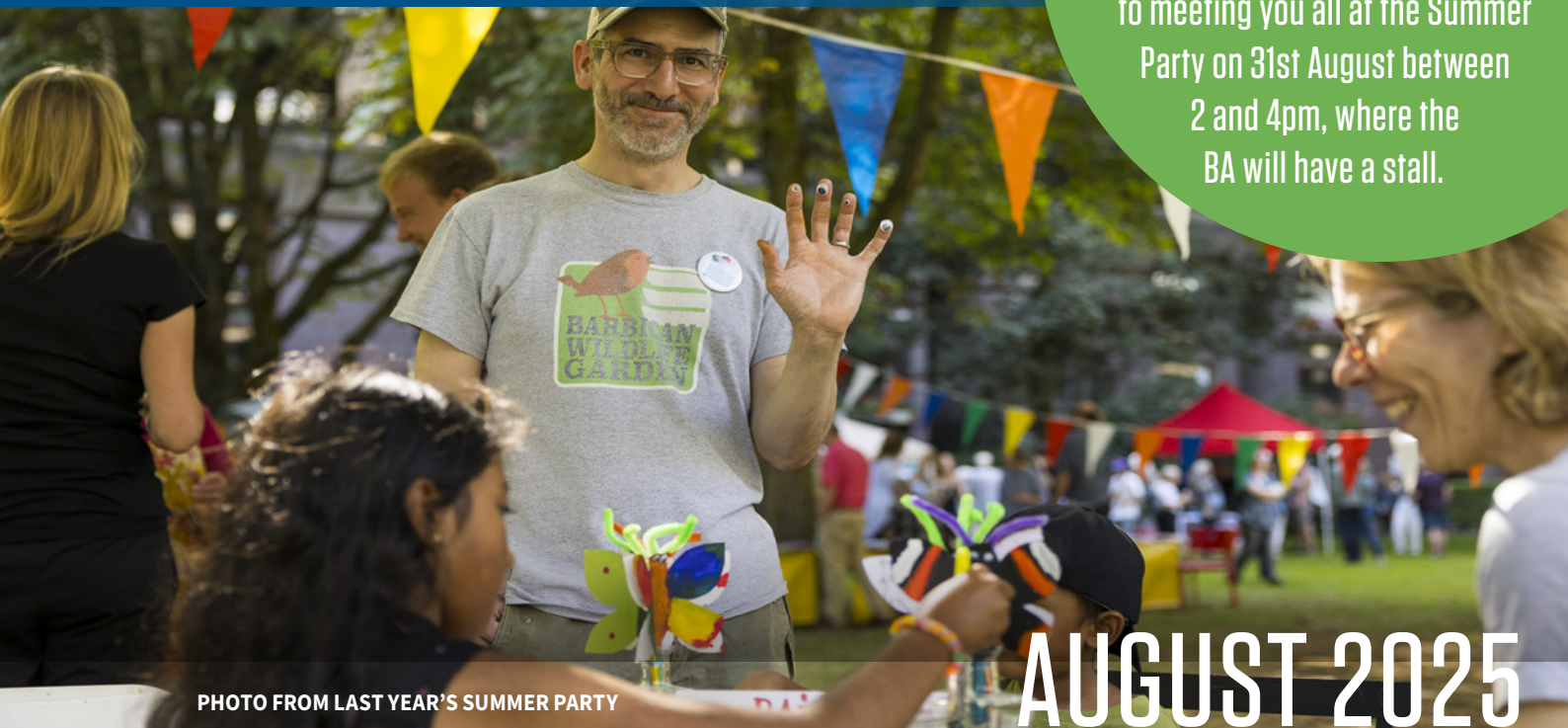
PHOTO FROM LAST YEAR'S SUMMER PARTY

The BA is looking forward to meeting you all at the Summer Party on 31st August between 2 and 4pm, where the BA will have a stall.