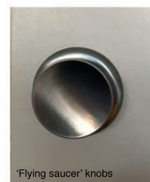
'Flying saucer' knobs