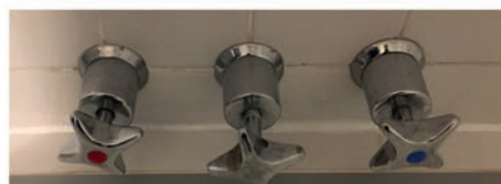
Original bath taps and mixer tap

...would appreciate your help! We need more original fittings that have been replaced during building work - specially the items shown here: