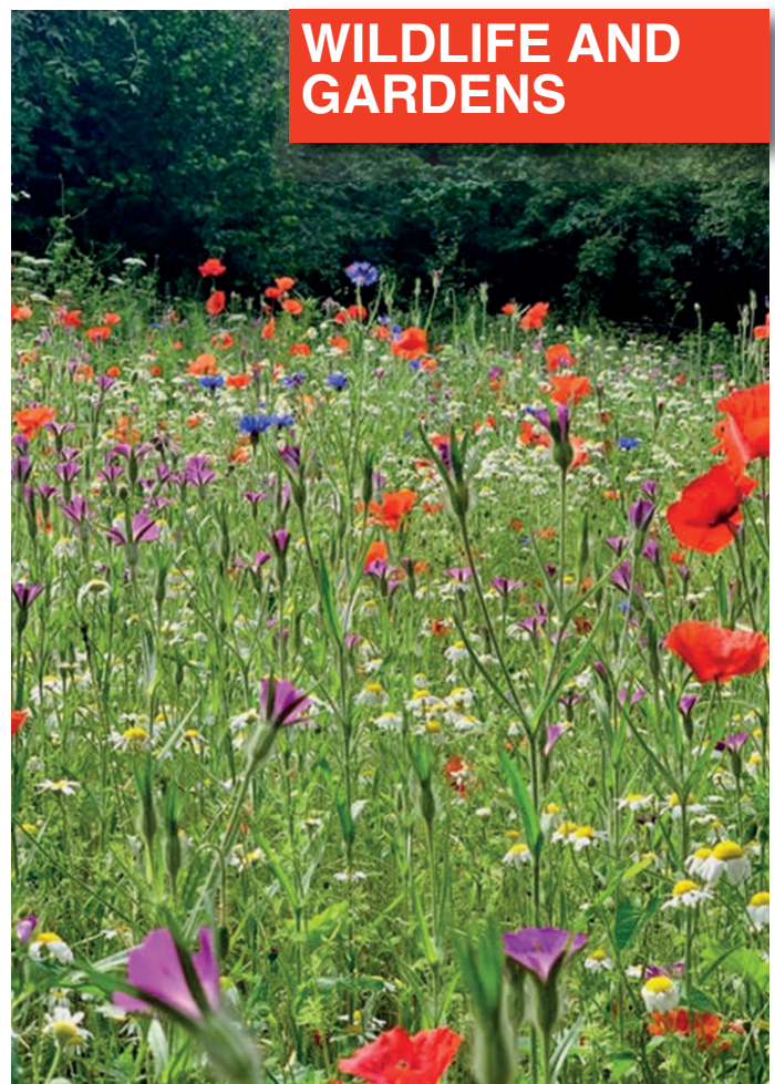
Photo of the meadow during 2019's event.