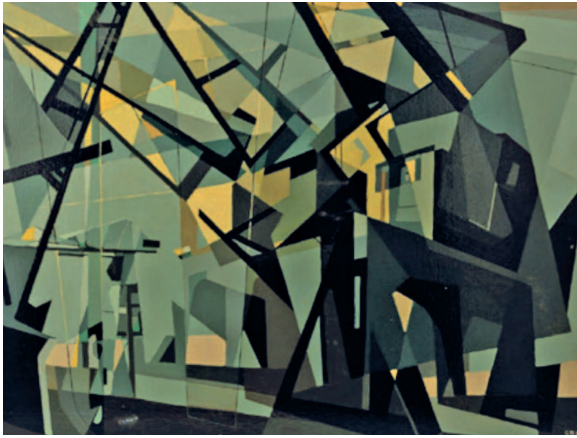
Structures portuaires (Nantes), 1954

For Tullio Crali (1910-2000), Futurism was not just a school of painting, but an attitude to life itself. Reflecting the movement's enthusiasm for the modern world, his imagery embraced technology and the machine as important sources of creative inspiration. However, with its particular focus on "the immense visual and sensory drama of flight", Crali's work is most closely associated with the genre of 'aeropainting', which dominated