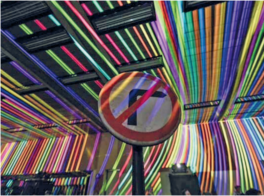
Finally, a change in direction!

not simply speculation to assess and much will be learnt from it. It may even be that the scheme will encourage more Barbican residents who have motor vehicles to switch to electric ones, given that there are now charging points in some Estate car parks. Following approval by the relevant City Corporation committees, the implementation of the scheme is subject to final approval from Transport for London.