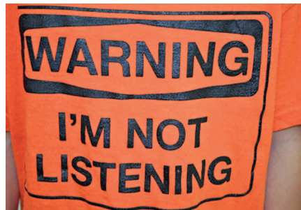
Time to listen and act

Given the unshrinking support of RCC members for the above text, it was most disappointing that the BRC decided not to implement this text, either in full or in part.