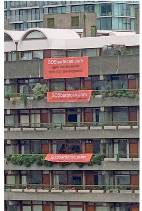
Seems they've got the message

in some circumstances, more than just exceptional ones, as at the moment, it does not have one. Were it to adopt a workable system in which councillors and their electors had confidence, many of the concerns might be diminished.