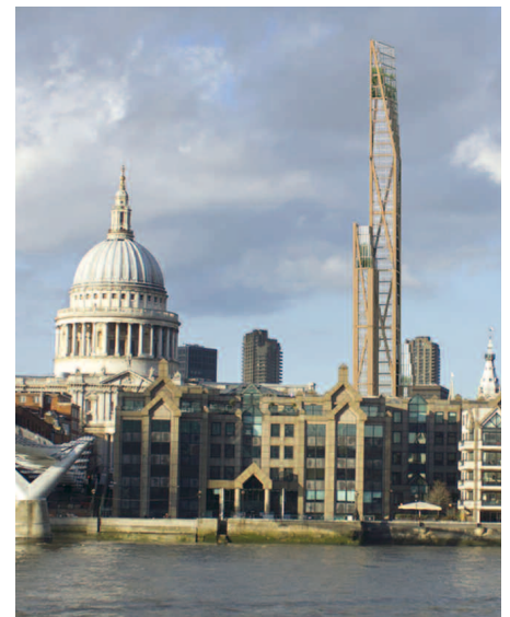
Ready for take-off?

Some readers may have watched the Channel 5 programme on Tuesday, 26 June on high tower buildings. PLP Architects has submitted a design for an 80-storey wooden tower block on the