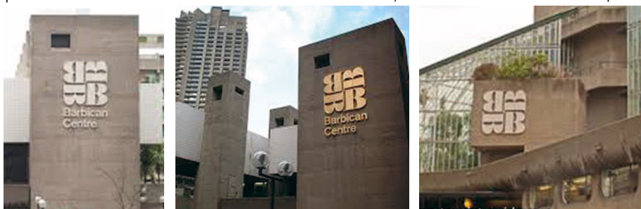
4Bs or not 4Bs? That's the question

Our concerns are for the light spillage, proposed until 11.00pm, especially so close to Defoe House, the cleaning of the surface underneath and the lack of consultation with the BA. Good practice in the Listed Building Guidelines, Vol.4, states that “cumulative changes [...] can, over the years, contribute to a gradual erosion of the visual integrity and architectural character of the estate”. When removed, the iconic signs are unlikely to be put back and we believe that it is better to wait until the full wayfinding review is complete before a decision is made. The “4Bs” are to be found in numerous places around the Estate.