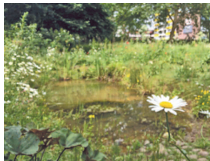
"greenfinches, goldfinches, frogs or maybe even a sparrowhawk or a fox"

The reward is the reactions of visitors, who tell