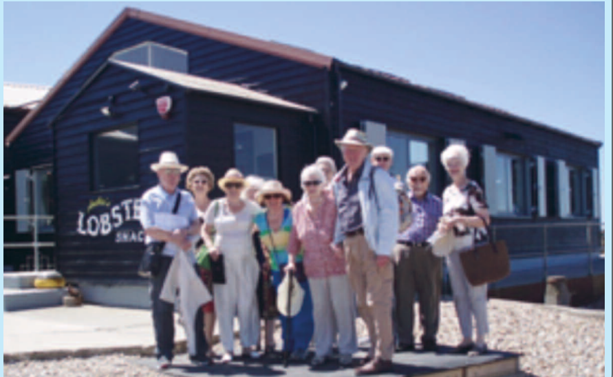
"those oyster bars. Idyllic!"