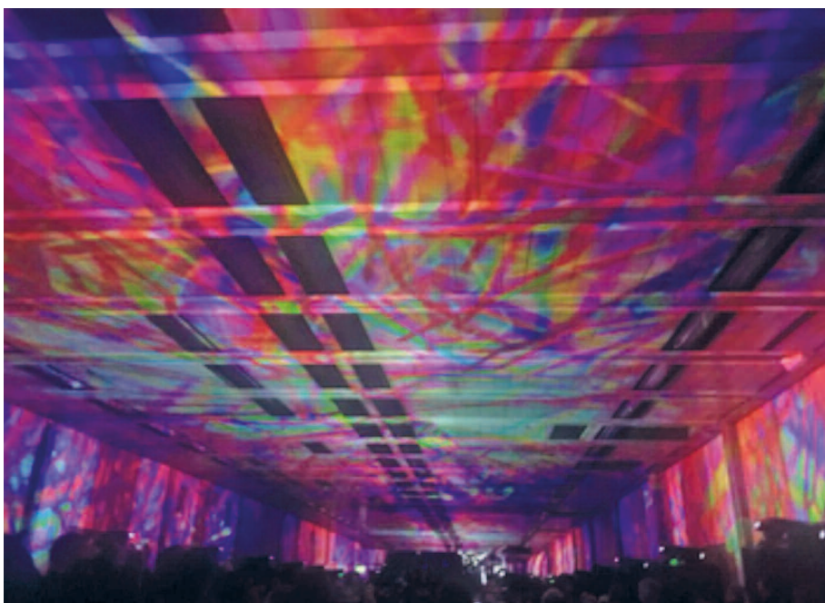
Thankfully, no trains!