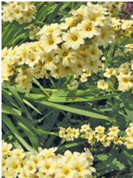
Spring having sprung

What is certain is that the freezing February weather took a heavy toll on our window-boxes. The traditional balcony pelargoniums have suffered greatly. However, this is a perfect opportunity to start from scratch and try something new; might this be the year for courgettes? They might not provide food security, but they grow quickly and have lovely flowers.