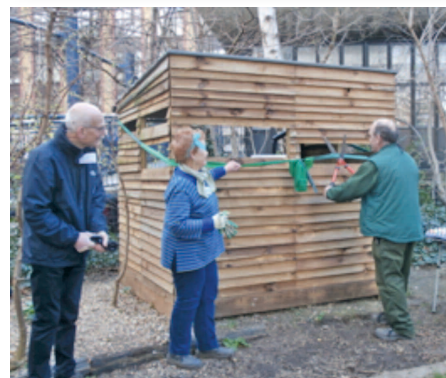
Hide and Seek

surfacing the paths so, for the time being, boots would be the best footwear for visitors. However, the yew and holly saplings, newly planted to help thicken the Fann Street hedge, where blackthorn is now blooming, have welcomed the rain. The Fann Street border has been extensively mulched with compost made in the Garden and recently enriched with a wonderful green manure from droppings from rabbits belonging to a member of Golden Baggers.