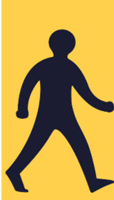
Not a Banksy but might help you find one

In the meantime, it remains unclear if the Banksy works that appeared overnight on both sides of Golden Lane, where it meets Beech Street, were “commissioned” or were entirely spontaneous. Conveniently, they coincided with the Arts Centre Gallery’s exhibition of the works of Jean-Michel Basquiat, who began his artistic career as a graffiti artist. Nevertheless, they presented a difficulty for the City, with its strong anti-graffiti policy. What is to be done with graffiti that is potentially worth a considerable amount of money and brings crowds to the Cultural Mile? The answer is to cover the works with acrylic glass; it’s perhaps a pity that the City did not affix it more elegantly.