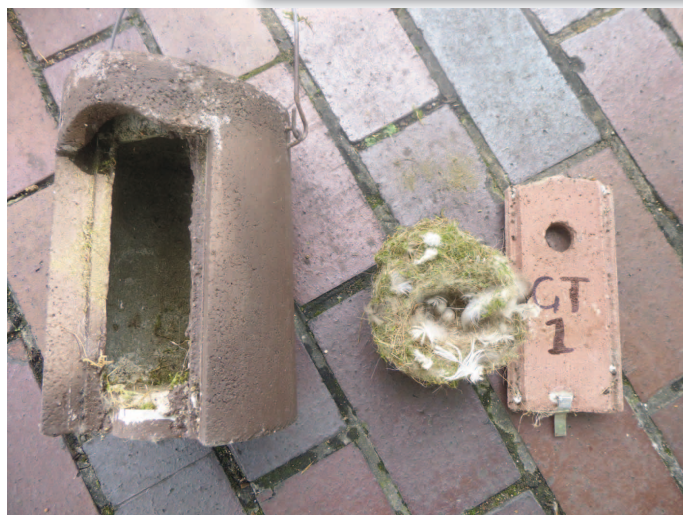
Blue Tit nest, St. Giles' Terrace

Chair, Sustainability/Air Quality sub-committee