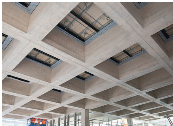
Inspired by the Barbican

At Farringdon Station, in which the square coffered ceiling of the eastern ticket hall on Long Lane, is said to be inspired by the Barbican,