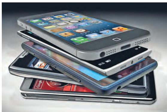
Smart phones are so useful, but can leave you a victim of crime.

More and more people are using smartphones these days and mobile phones have indeed become 'smart'. Gone are the days when they were used for just browsing the internet, making calls and checking emails. They are now also widely used for online banking, shopping, social comment and communication and for controlling home appliances when paired with other devices as well as numerous applications (apps) which can be downloaded for free or purchased.