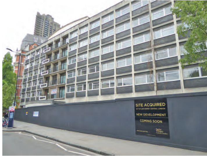
Bernard Morgan House – “new development coming soon” but delayed again.