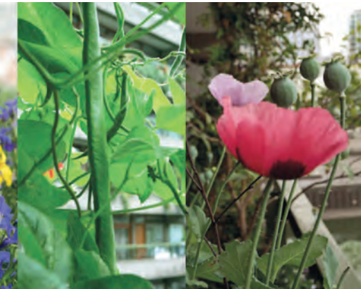
Barbican balconies can be colourful and productive.

Neighbourhood budget and will include plants to improve air quality. Varieties for sun and shade, and both flowering and edible plants will be available. Look for more details in the BEO's Friday emails.