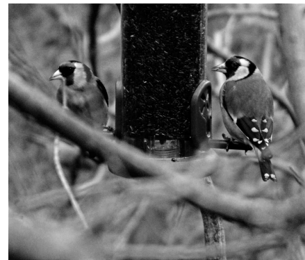
Goldfinches enjoying niger seed in a bird feeder. Find more photos on our Facebook page https://www.facebook.com/barbicanwildlifegarden/

inter-generational interactions" while minimising anti-social gatherings. On top of all this it must be easy to maintain and look good from the podium level and surrounding flats.