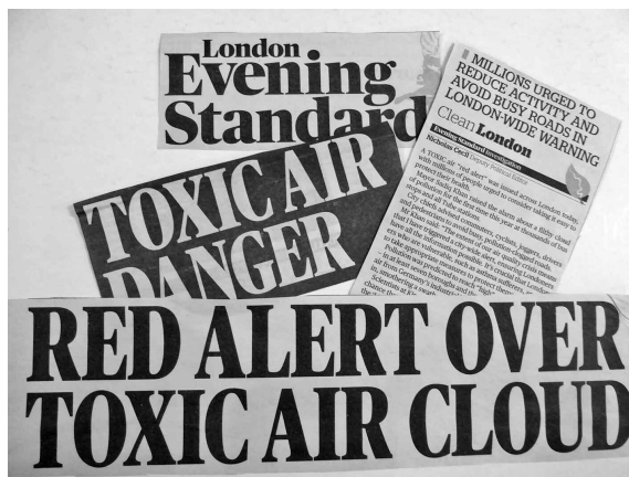
London's poor air quality has hit the headlines already this year

the City Corporation and the rest from the Mayor of London. The intention is to develop a range of measures to reduce air pollution with the aim of rolling them out by April 2019.