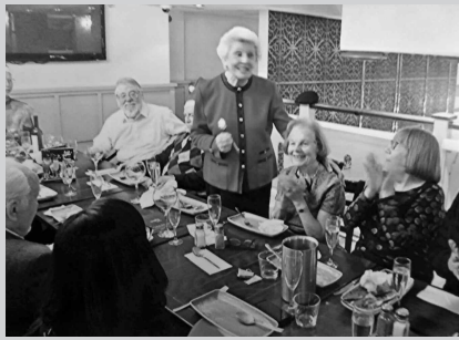
Tuesday Club members enjoying their New Year lunch.

afternoon in the Lilac Room, 02 level of Seddon House, 2.45 to 4.00pm.