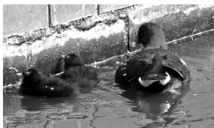
A moorhen and chicks in the lake by the Church.