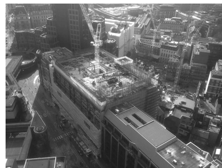
Raising the roof of 160 Aldersgate – a view from Lauderdale Tower.

The City of London Local Plan details its good intentions regarding planning and redevelopment in the area (namely Policy DM21.3, as highlighted in February's newsletter). The question remains whether