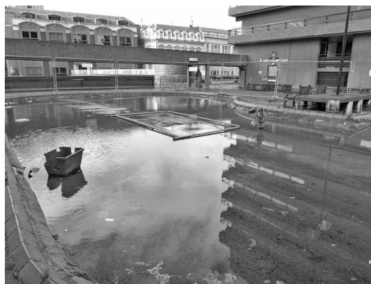
Rain stopped work. The Beech Gardens project has been held up by the excessive rain. A system of monthly meetings has been set up for residents to learn of progress and ask questions.

The Asset Maintenance Working Party has come out of suspended animation, now