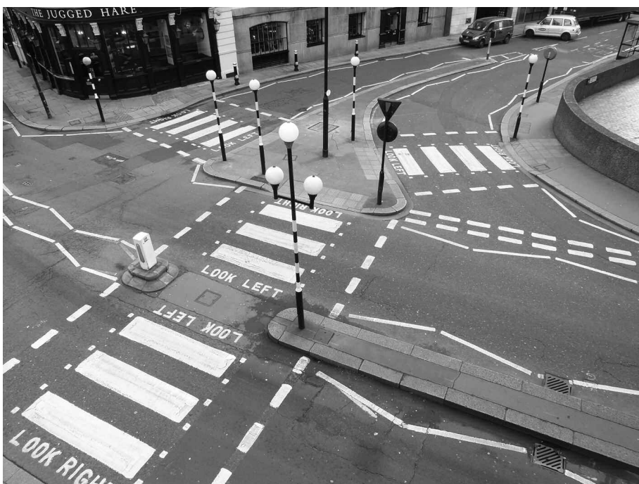
Changes are coming to the junction of Beech Street and Silk Street including moving the zebra crossings.