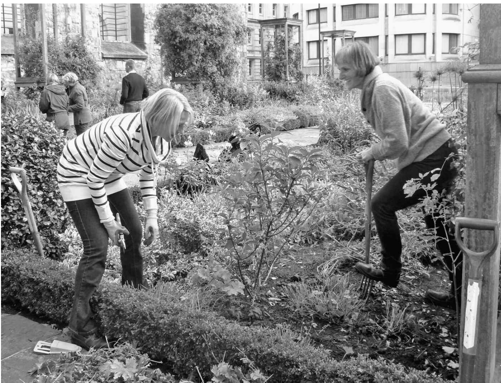
Friends of City Gardens volunteers working at Christchurch Greyfriars. Read about the group's successful first year on p 6.

The contentious issue of the seating on St Giles Terrace and Ben Jonson Highwalk has also now been resolved. In response to many complaints when the seating and planters were first installed, the streetscene team decided to do another survey