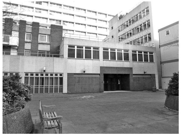
The old Lazard office at 21 Moorfields – the next proposed development on the Barbican's edge.

The proposed height increase is modest. The building must keep below the existing