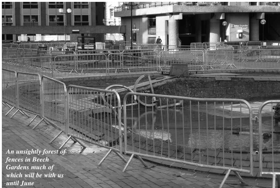
An unsightly forest of fences in Beech Gardens much of which will be with us until June