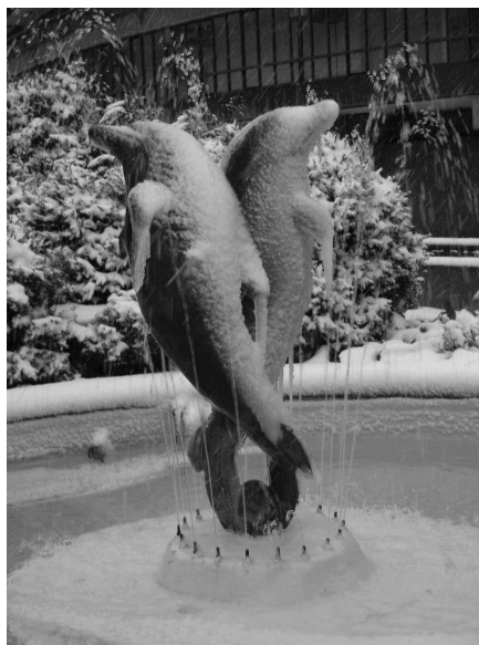
The snow fails to stop the dolphins playing in the Beech gardens fountain

We are also proposing to hold a series of talks/meetings for members on matters relevant to residents. For example we plan to invite someone to come and talk about the new responsibilities for health and social care that local authorities are taking on and what these mean for the City and hence for us as residents.