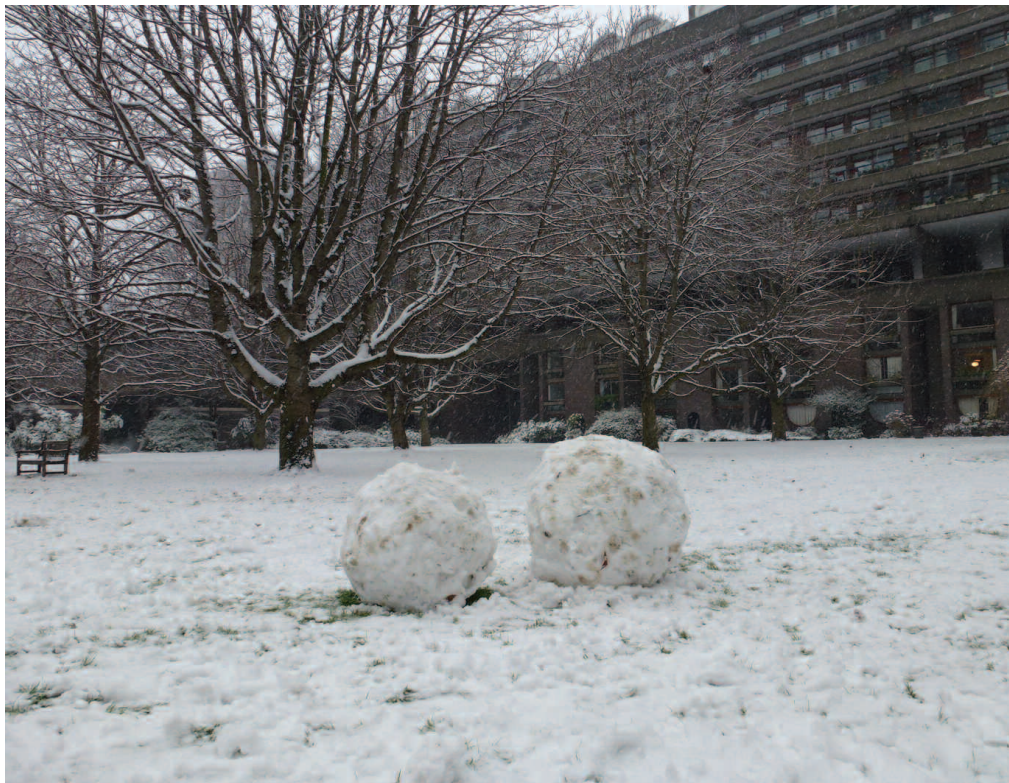
Barbican children emulate Andy Goldsworthy's snowball sculptures