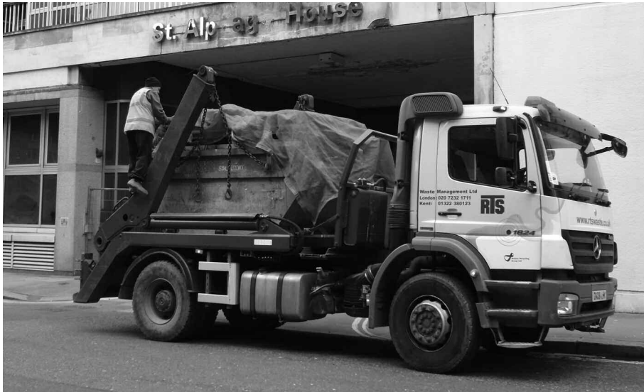
The demolition of St Alphe House is to start shortly

Indeed, we had hoped that an area round the Barbican might be part of the City's bid for money from the London Mayor to improve air quality. It looks as though it won't be, but the City's air quality officer (who spoke at last year's AGM) is hoping that if the bid is successful her team will use it to experiment in a different part of the City with different ways of improving air quality, and those techniques that are successful can then be applied elsewhere in the City, including round the Barbican. These might include things like street washing, dust suppression methods, taxi ranks, green corridors, 20 mph zones.