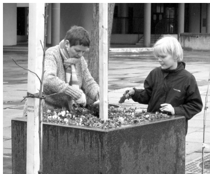
Residents planting a quince tree in the Fann Street Community orchard

On a cold wet Sunday in February (was there any other sort?) Barbican and Golden Lane residents created a community orchard in Fann Street. Twelve fruit trees were planted in the on-street containers, donated by the City Corporation. Heritage apple trees, including Colonel Vaughan and Lady Sudeley now rub shoulders with plum, quince and damson trees. The orchard should produce a few fruits this autumn and become more productive every year.