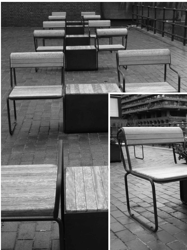
Now you see them, now you don't. The central tables have had the covers removed and become planters.