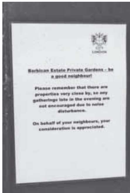
Be a good neighbour in the gardens

neighbours: that they don’t encroach on our space, take our light, block our routes, or disturb us with their noise.