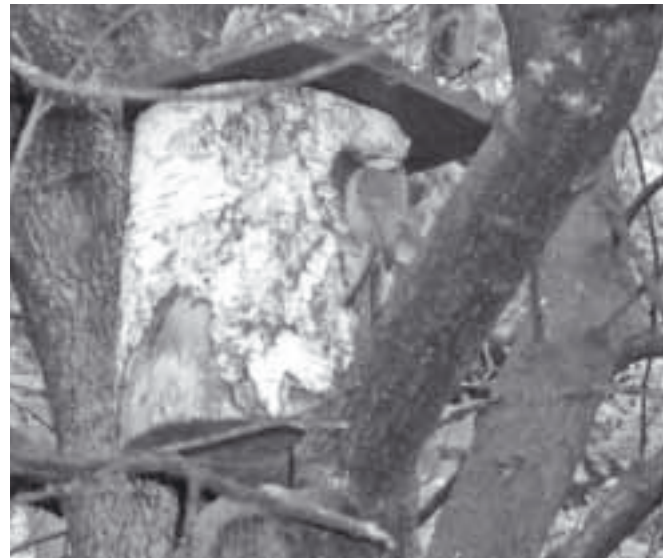
A prospective resident inspects a Barbican property

Fann Street wildlife garden. Preparations are already underway for the garden's participation in the London Open Garden Squares Weekend on June 11th-12th when 215 London gardens, many usually closed to the public, will welcome visitors. Barbican residents will, as ever, enjoy free entry to the Fann Street garden with their key.