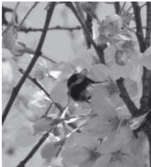
Spring in the Barbican. The birds – nesting on the lake – and the bees – enjoying the blossom in the Fann Street wildlife garden. Read more about the Barbican's bird and insect residents on page 6.