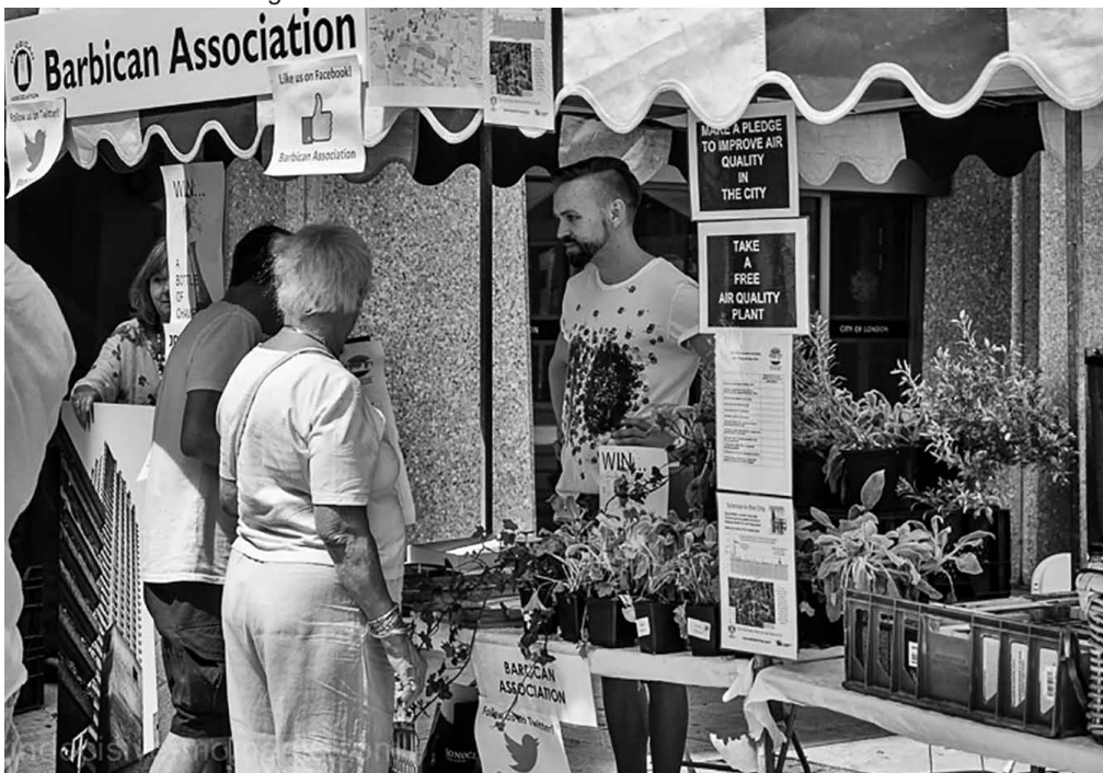
The BA’s stall at the City Community Fair in July gave away 75 plants as part of an effort to encourage residents to make their balconies bloom, and improve air quality.