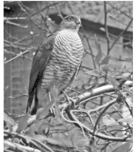
A sparrowhawk spotted in Thomas More garden

This is the eighth year Barbican residents have counted birds in our gardens and other gardens across the City as part of the RSPB's Big Garden Birdwatch on 24/25 January.