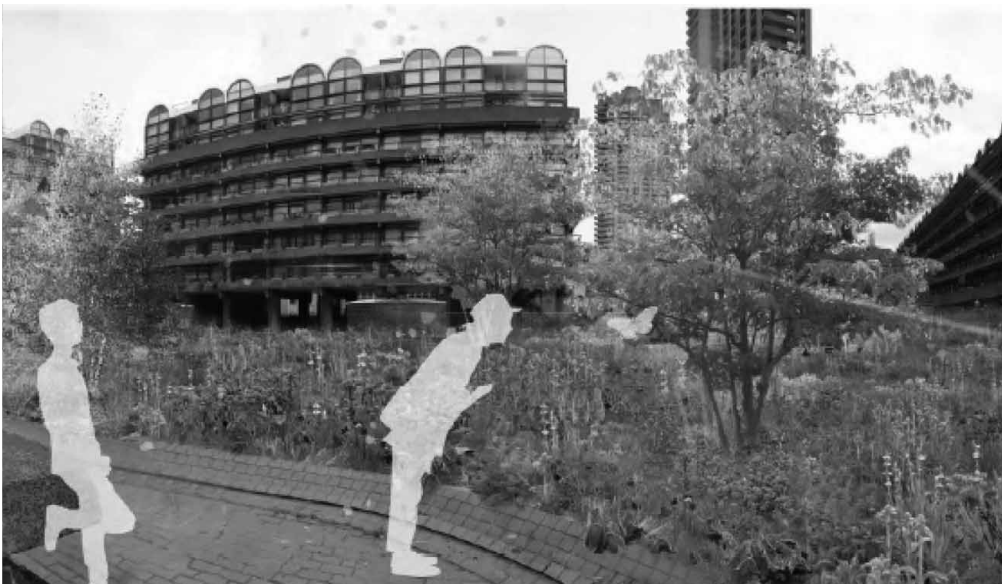
Work will soon begin on planting the Beech gardens to a design by Nigel Dunnett, whose credits include the London Olympic Park and several show gardens at the Chelsea Flower Show. Five lucky residents will be invited to help with the planting.